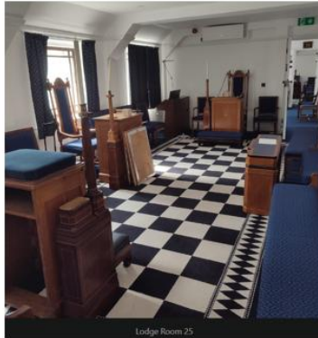
Lodge Room 25